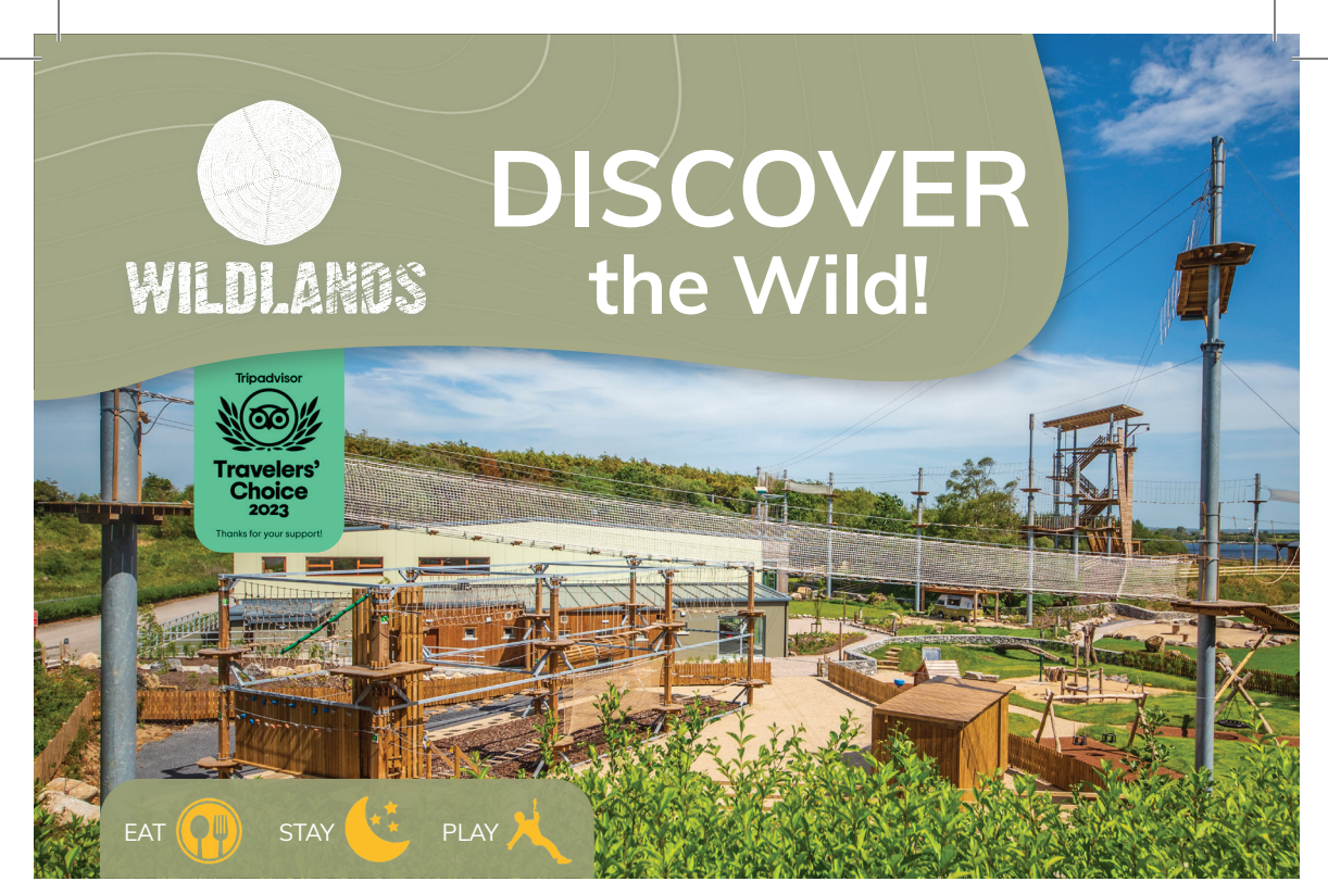
Team Building • Away Days • Functions • Tailored Adventure Experiences